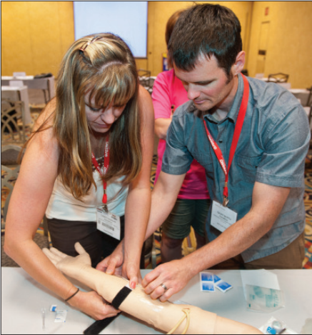
NAEMT continuing education courses teach hands-on skills.

If your organization is looking to promote its products and services to EMS educators and students, NAEMT has the market cornered. On average, NAEMT educates nearly 70,000 students per year. We work with over 2,500 unique training course sites and 12,500 EMS educators to provide our world-renowned continuing education courses.